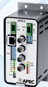
Ethernet, DeviceNet, ProfiBus, ProfiNet and Serial interfaces available